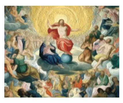
All Saints' Day