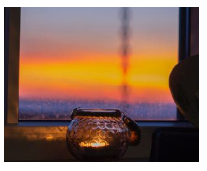
All Souls' Day

At 3:00pm join your diocese online for a service of Prayer and Remembrance for the Dead and for the Comfort of the Bereaved.