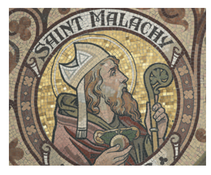
Feast of St Malachy

At 6:00pm as the day grows darker and draws to a close we invite you to place a lit candle in your window and recite the Angelus.